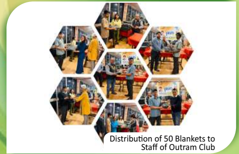
Distribution of 50 Blankets to Staff of Outram Club