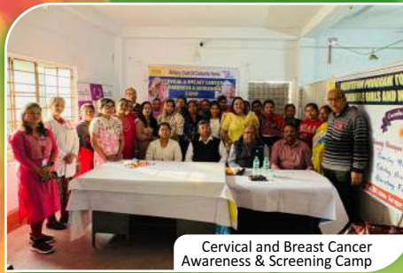
Cervical and Breast Cancer Awareness & Screening Camp