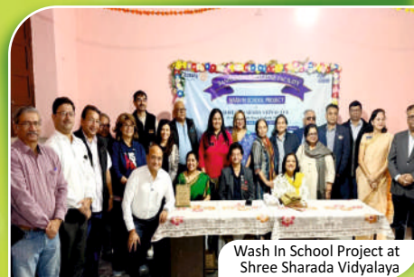
Wash In School Project at Shree Sharada Vidyalaya

"We meet every Friday at 7 PM at EITMA, Oswal Chambers, 5th Floor, 2 Church Lane, Kolkata - 700001".