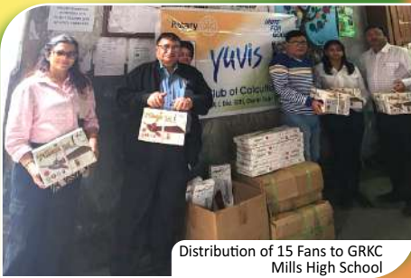
Distribution of 15 Fans to GRKC Mills High School