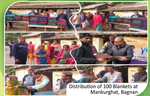
Distribution of 100 Blankets at Mankurghat, Bagnan