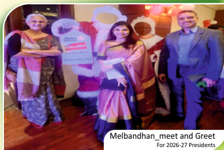
Melbandhan_meet and Greet For 2026-27 Presidents