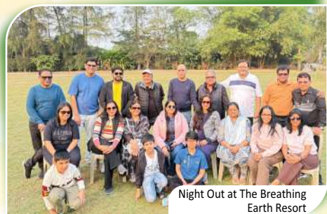
Night Out at The Breathing Earth Resort