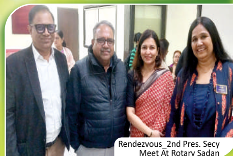
Rendezvous_2nd Pres. Secy Meet At Rotary Sadan