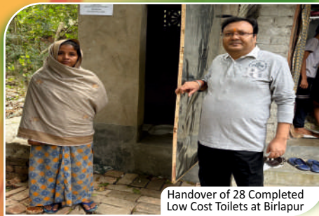
Handover of 28 Completed Low Cost Toilets at Birlapur