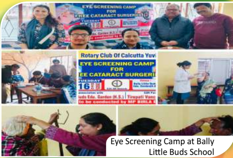
Eye Screening Camp at Bally Little Buds School